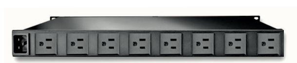
Expert Power Control 8035-6: 8 loads with NEMA 5-15 plugs can be connected on the rear panel of the power distributor