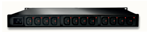
Expert Power Control 8045-2: 12 IEC-Lock outlets on the rear panel prevent unintentional disconnection of the cables